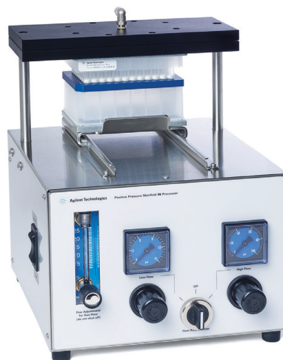
Figure 2. Agilent positive pressure manifold 96 processor.