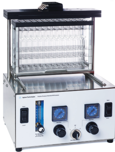
Figure 1. Agilent positive pressure manifold 48 processor.

The PPM-48 and PPM-96 are easily incorporated into any laboratory. The modular rack feature enables simple stacking of cartridge and collection racks (PPM-48) or 96-well plates and collection plates (PPM-96). Cartridge and collection racks are physically keyed to fit onto the sliding platform, and onto each other in one orientation only. This ensures stability during platform movement, and reduces the potential for rack orientation mix-ups. The processors are self-adjusting to accommodate different size 96-well plates, cartridges, test tubes, and even autosampler vials without the need for extra spacers. This makes Agilent PPM processors an easy and efficient solution for sample processing.