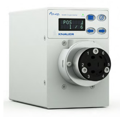
Valve drive VU 4.1 (AWA01) with 6 port 2-position valve (AVC28AC)