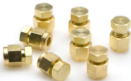
Figure 1: Two-piece brass storage caps.

standard sampling methods – for example, US EPA Method TO-17, ASTM D6196 and EN ISO 16017.