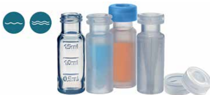
SureSTART vials and caps shown below are in 100 pack, but are also available in 5,000 and 10,000 pack options.

To assure no contamination or background corruption for PFAS analysis, we have more than one recommended closure. You are able to use one piece polypropylene snap ring caps or polypropylene 9 mm screw thread caps with a thinned penetration area. When resealing for multiple injections is important, we offer snap ring and screw thread caps with a silicone/polyimide septum for trouble free analysis.